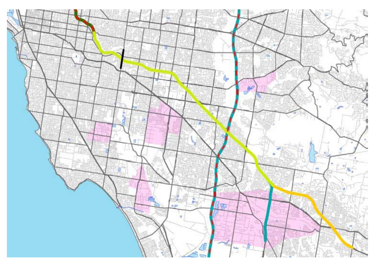
Figure 5: Monash Freeway –Warrigal Road to Clyde Road