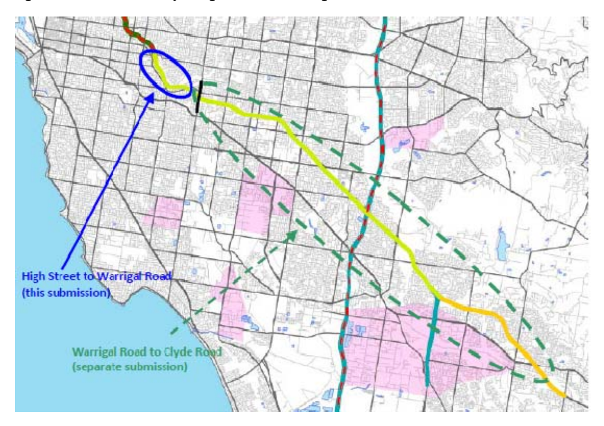
This assessment was prepared by the Office of the Infrastructure Coordinator in April 2012 for the Infrastructure Priority List.