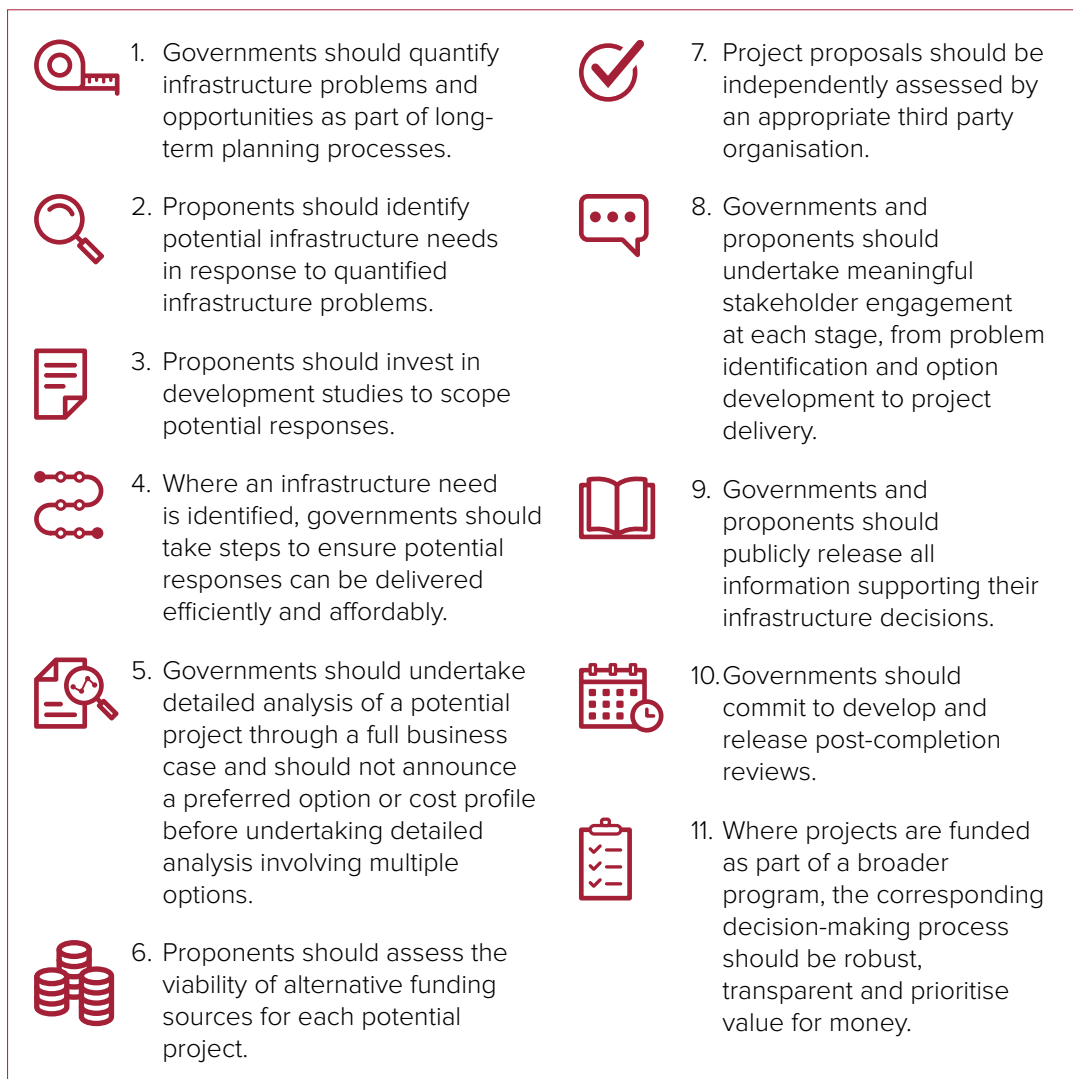
Figure 2: Infrastructure Australia's Infrastructure Decision-making Principles

The Principles lay out clear expectations for nationally significant, publicly funded projects across the project lifecycle – from problem identification to post-completion review.