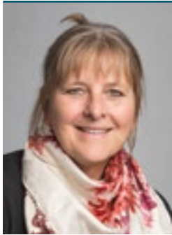
Gabrielle Trainor AO