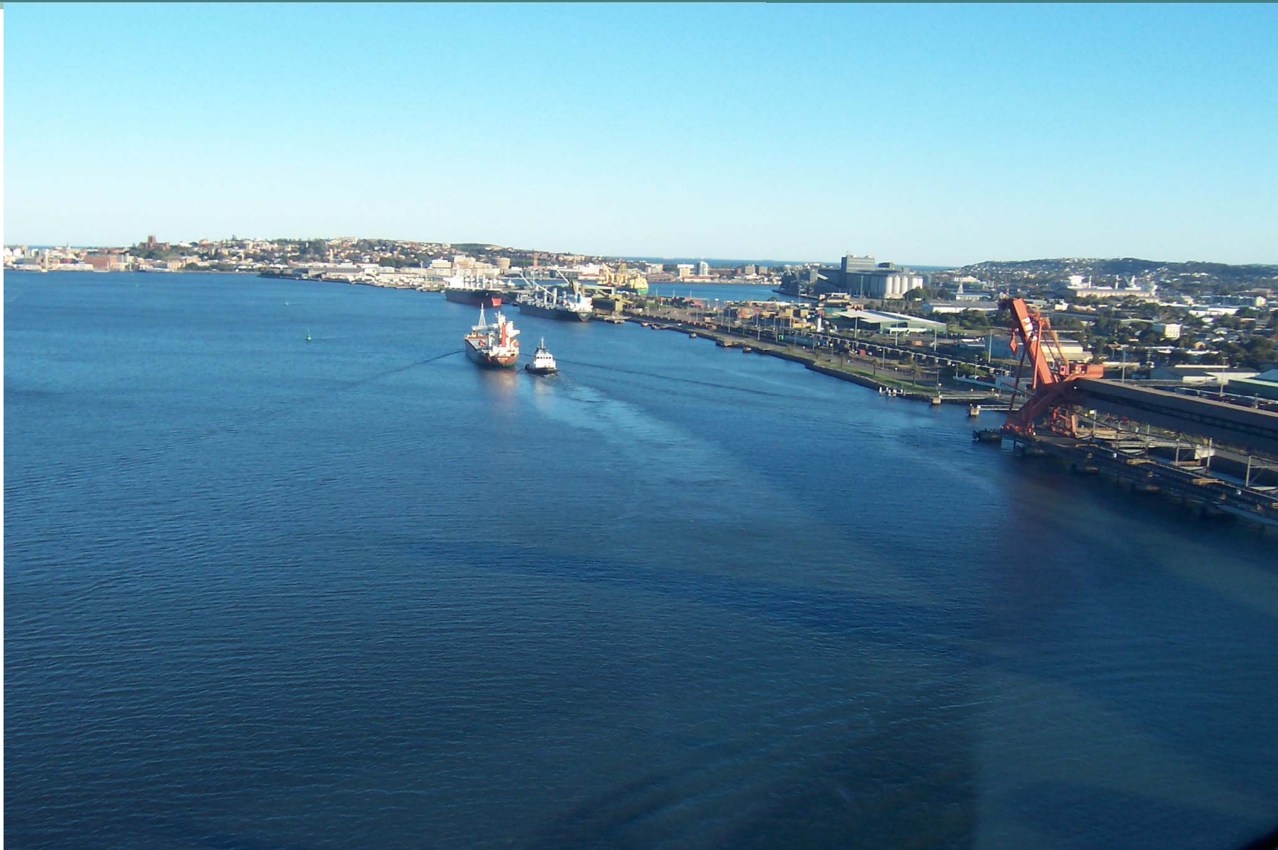
Newcastle Port, NSW

Australian Government Infrastructure Australia