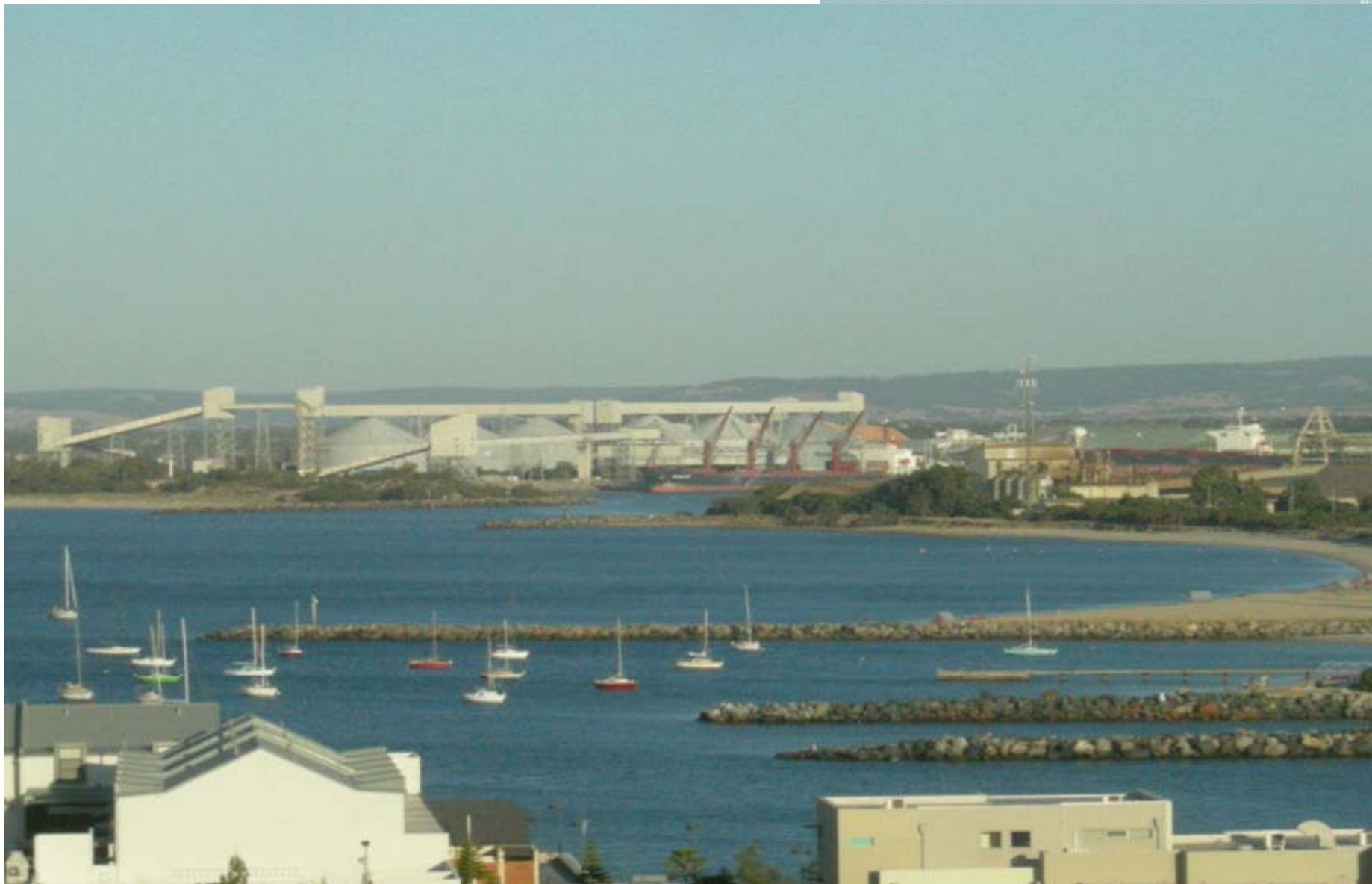
Bunbury Port, WA