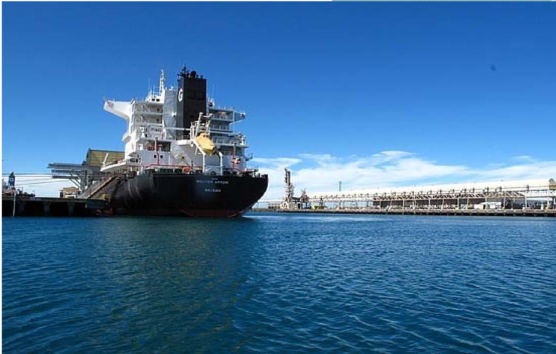
Port of Portland, VIC

Australian Government Infrastructure Australia