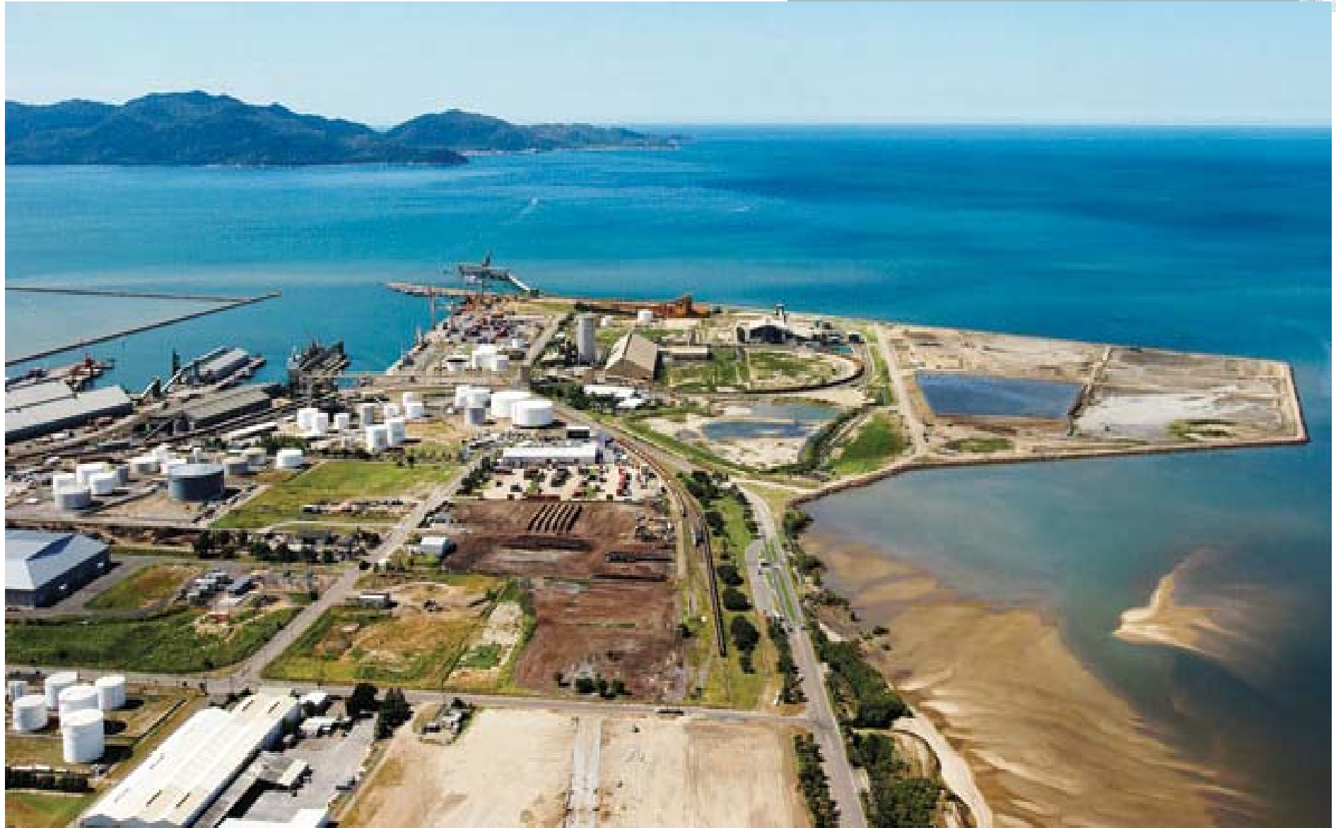
Townsville Port, QLD